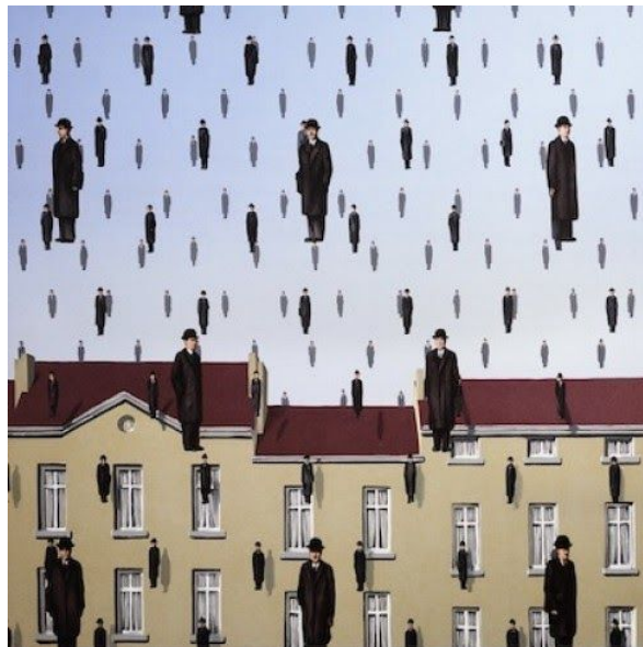
Golconda, 1953 by Rene Magritte

The Street Artist, Pejac made a piece of lockdown artwork inspired by :